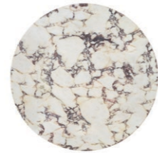
CALACATTA VIOLA MARBLE