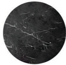
NERO MARQUINA MARBLE