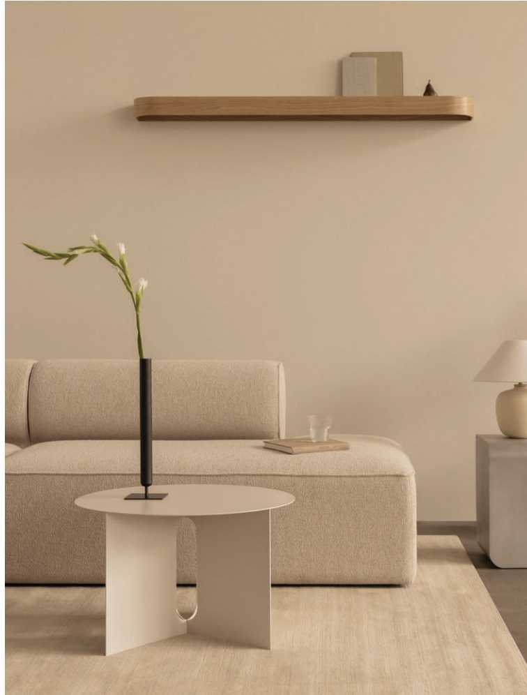
ANDROGYNE SIDE TABLE, Ø63 Designed by Danielle Siggerud