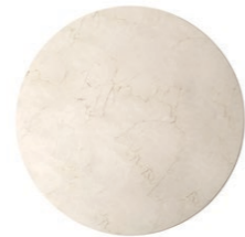
CRYSTAL ROSE MARBLE