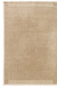
LIMESTONE BEIGE 5860139