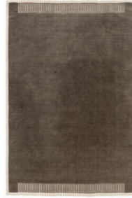
MARBLE GREY 5860969