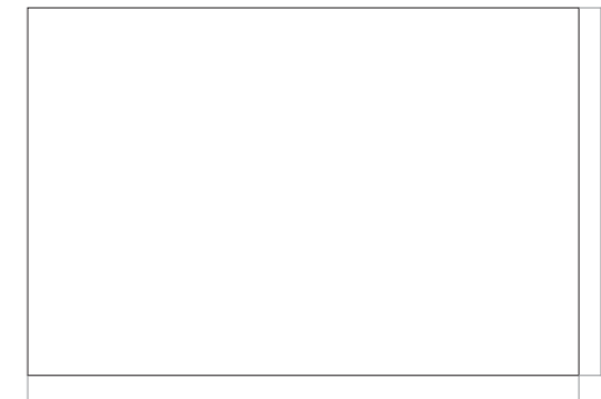
W: 300 cm / 118,1"