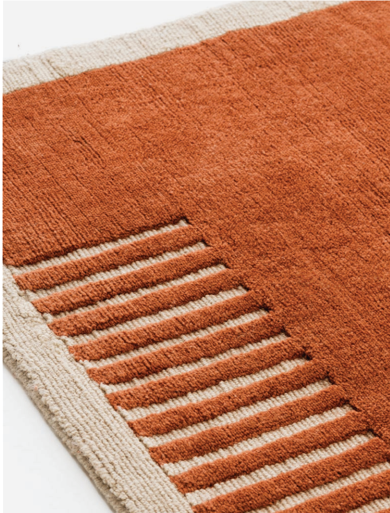
DUOMO RUG Designed by Norm Architects