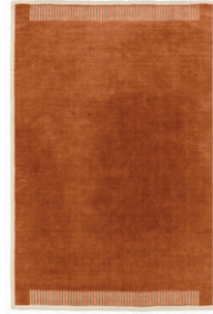
TERRACOTTA RED 5860269