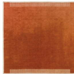
TERRACOTTA RED 5861269