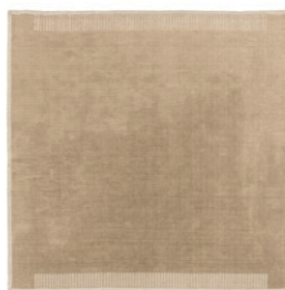
LIMESTONE BEIGE 5861139