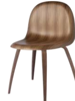
// American Walnut