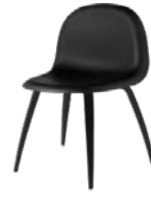
// Blackstained beech