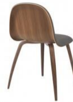
// American Walnut