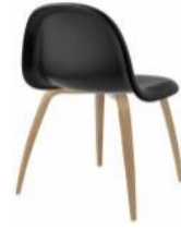
// Blackstained beech