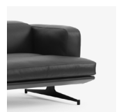
Noble Black Leather