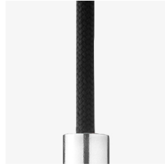
Clear glass and black fabric cord