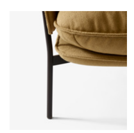
Warm black powder coating