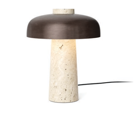
REVERSE TABLE LAMP, BRONZED BRASS 1410619Y

The Reverse Table Lamp is sold included five interchangeable plugs suitable for North America, Australia, China, Europe and the UK.